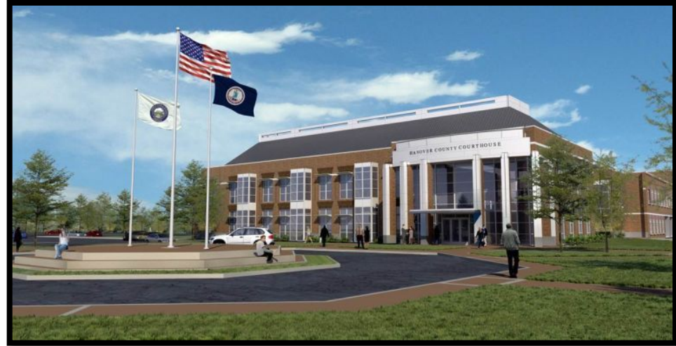
Hanover Opening 2017