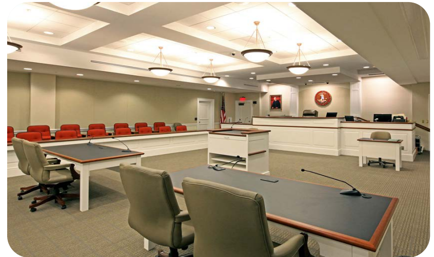
Spotsylvania Circuit Court