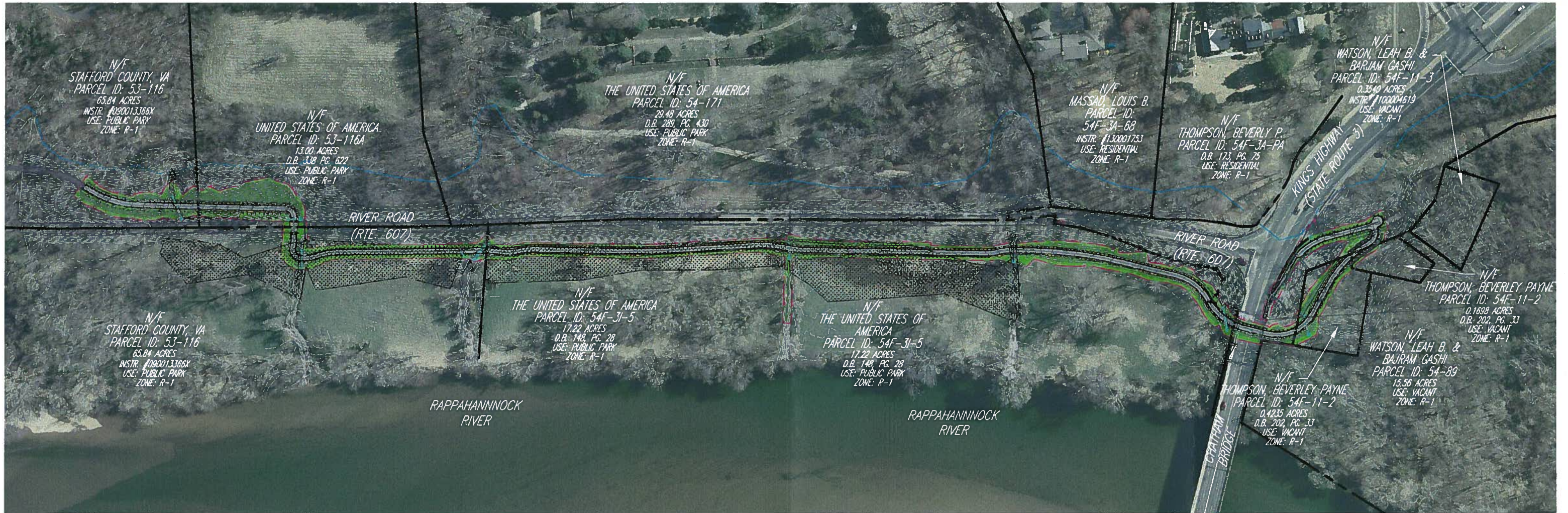
Belmont-Ferry Farm Trail - Phase 4